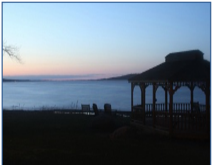
Figure 2 – Galilee's gazebo by the lake.

the foyer. The rest of the bedrooms are on the second floor and have full bathrooms. Galilee includes a brand new piano, 2 covered porches, a gas fireplace, and a kitchenette where coffee, tea and snacks are available throughout the day and evening. Wi-Fi is available in the meeting room in Galilee and in the Dining Hall next door.