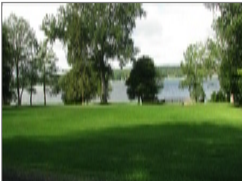
Figure 4 – Silver Lake as seen from Asbury Manor.