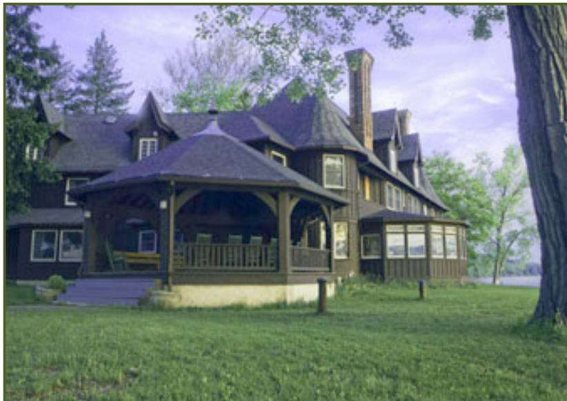
Figure 1 – One of the covered porches with Owasco Lake in the background.

Casowasco boasts over 200 wooded acres, a beautiful gorge, and over a mile of shoreline on Owasco Lake, on the western shore between Auburn and Moravia. Casowasco is owned and operated by The Upper New York Conference of The United Methodist Church. They open their facility to churches, educational groups, and other nonprofit organizations without regard to religious affiliation and do nothing to actively push their religious views on guests. Casowasco is approximately one hour's drive from Syracuse Hancock Airport.