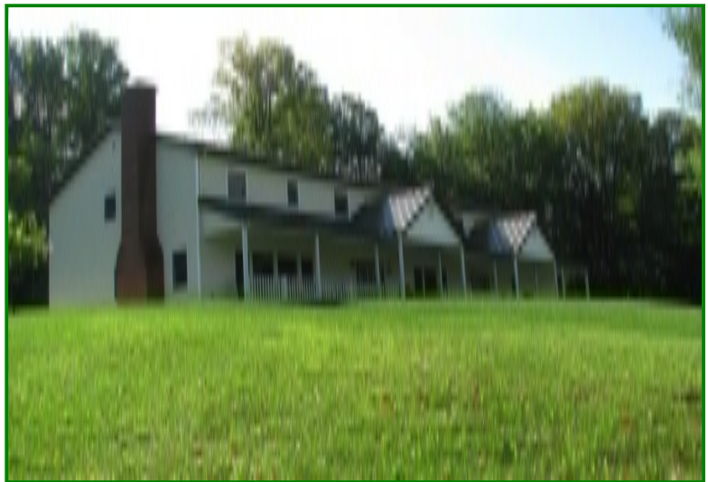
Figure 3 – This is the sun deck overlooking Silver Lake.

Asbury is their newest building, opened in January 2008 and is a beautiful retreat center that sleeps 39, including two handicapped accessible bedrooms with adjoining baths on the first floor. We usually have between 15 and 20 retreat participants; all rooms can comfortably be semi-private and every room has a full bathroom. Asbury Manor has Wi-Fi and a kitchenette where coffee, tea, and snacks are available throughout the day and evening. This building is next to the Dining Hall, which also has Wi-Fi.